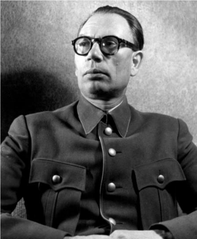
Fig. 1. General A.A. Vlasov