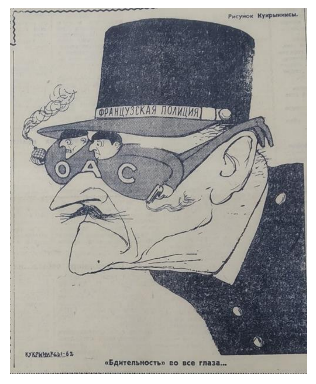
Fig. 4. Pravda. 1962. May 18

the actions of the very Charles de Gaulle, with his belief of the Sahara being a French territory, were "sabotaging peace" (Stil', 1961: 4). An Izvestia correspondent wrote directly that "... it looks like to Charles de Gaulle the sole purpose behind the meeting at Évian-les-Bains is to prove to public opinion the impossibility of negotiating with the mutineers" (Zykov, 1961: 2). Figure 3 represents a caricature drawing of the maneuvers of the French side focused on the proposition of disadvantageous terms governing Algeria's self-determination. France's take-it-or-leave-it approach was condemned by the Pravda newspaper too: "Essentially, both take-it-or-leave-it "choices" meant the continuation of the war, as none of them opened the way to freedom and independence for a united Algeria, which the Algerian people have fought for over a seven-year period" (Ratiani, 1961: 5).