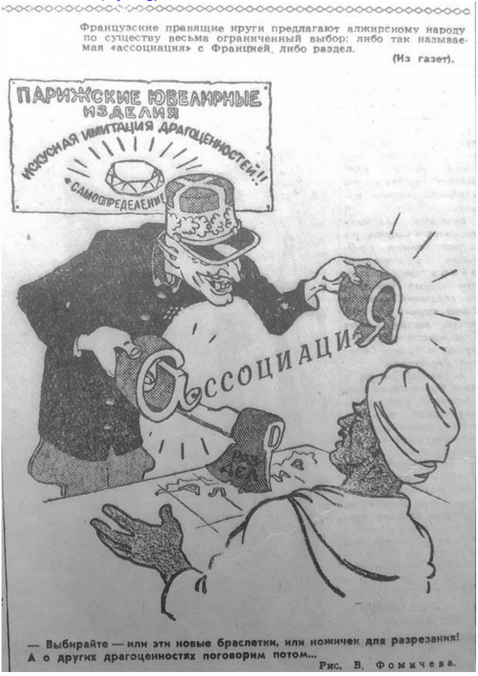
Fig. 3. Izvestia. 1961. May 23

In this regard, the events that took place between April and May 1961 were judged negatively. Many of the articles that covered the new mutiny in Algeria argued that the conspiring generals would not have been able to set objectives such as "marching on France" or altering the existing system of governing the country without the backing of influential political and economic circles (Trudnye dni..., 1961: 5). In addition, many of the sources spoke of a link between the mutineers and the US and argued that NATO was trying to make the Algerian War continue: "... military spending on Algeria is regarded as a part of France's contribution to "the common defense". This fact... indicates the seriousness of NATO's responsibility with regard to the war in Algeria" (Drug kolonizatorov..., 1961: 3).