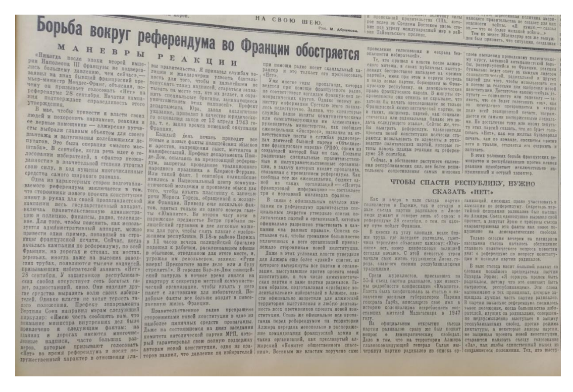
Fig. 1. Pravda. 1958. May 16

Specifically, in May 1958 the Soviet press was all over the Algerian military putsch. It condemned the intentions of General Charles de Gaulle to assume the reins to the Republic as a threat of a military dictatorship being established (Figure 1). The Soviet newspaper Pravda wrote the following on May 16: "As soon as the mutineers in Algeria seized power in the major cities, and they were openly joined by members of the Supreme Command of the French army there, Charles de Gaulle stepped forward as a candidate for the military dictator. The general idea of the collusion plan became clear to everybody" (Bor'ba v zashchitu..., 1958: 3). The ideas of the dangers of a military dictatorship being established and of the active resistance by the French people were disseminated in the Soviet press at the time by way of caricature drawings as well (Figure 2).