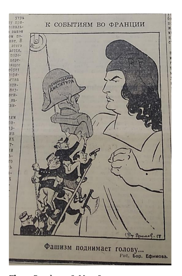
Fig. 2. Pravda. 1958. May 18

The condemnation in the press over Charles de Gaulle's policy in Algeria continued throughout 1958. It had to do with the creation of the "public safety committees", which, as suggested by Jacques Duclos, Secretary of the Central Committee of the Communist Party of France, were intended to "create a mass deGaullist movement" and, "similar to Mussolini's fascist organizations, would seek to deploy Charles de Gaulle's agents in localities and in enterprises" (K novomu pod"emu..., 1958: 3).