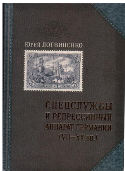
Fig. 1. Book cover