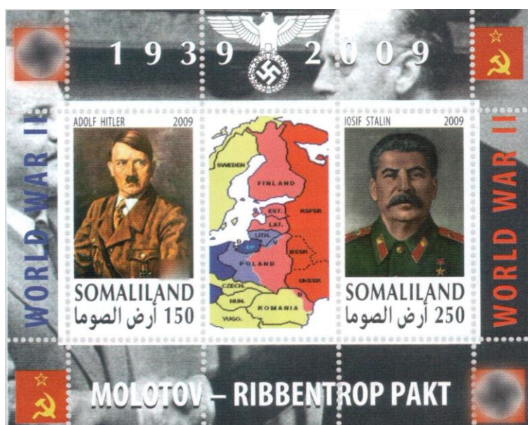
Fig. 2. A stamp dedicated to the Molotov–Ribbentrop Pact