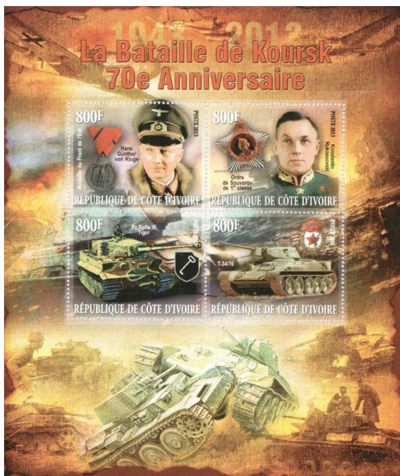
Fig. 3. A stamp dedicated to the 70th anniversary of the Battle of Kursk

I am sincerely grateful to the author for his efforts to imbue his book with a feeling of national pride, enhanced national identity and the experience of belonging to a victorious nation. In a broader sense, the book lifts the veil on the core ideas behind the national consolidation of the Russian super ethnos, so clearly manifested in the Great Patriotic War. The study suggests having a closer look at possible developments in the dialogue between Russia and Europe and makes the reader feel that many of our positions are not that distinct because of our long-lasting coexistence.