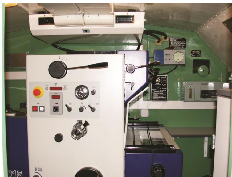
Fig. 3. Printing section

The printing section of the product provides printing of A3-format newspapers using an offset form made on a form-factor laser automatic machine in the publishing section.