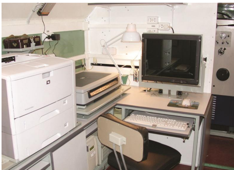
Fig. 2. Editorial and publishing section