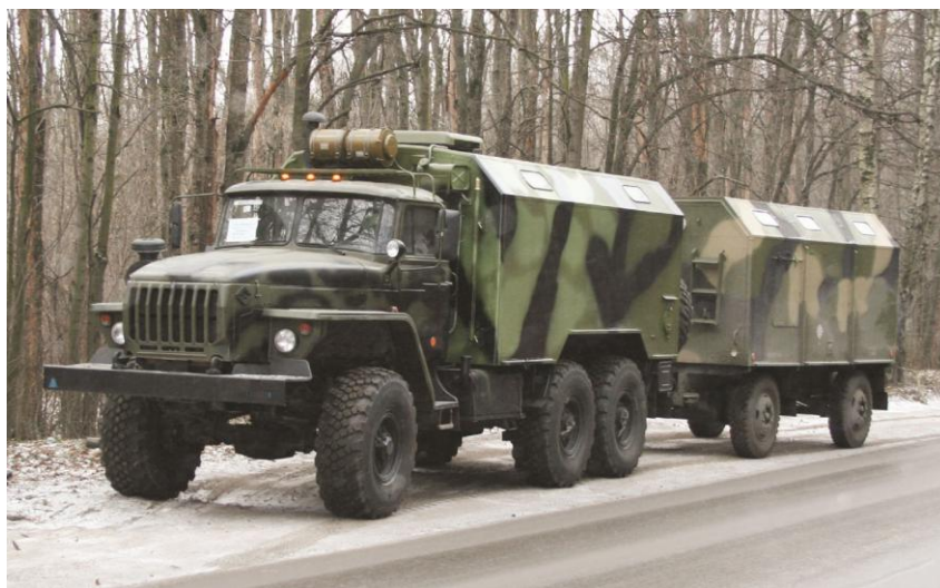
Fig. 1. Combat auto-printing mobile unit BPK-63MKL

BPK-63MKL was designed in the early 2000's at the 106th Experimental Optical-Mechanical Plant in Moscow. It was created in the department of the Development of technical means of computer systems and industrial automation (Russian arms forum). In 2005 the combat auto-printing mobile unit BPK-63MKL was included in the inventory of the Russian army (Bashlakov, 2009). The main purpose of BPK-63MKL is to ensure the prompt publication of multi-colored printing products in A3 format. In addition, it is possible to publish printed materials using data obtained from artificial earth satellites using the set of satellite equipment installed in the mobile unit.