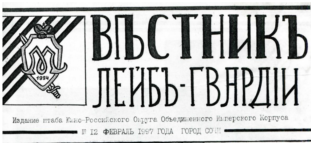
Fig. 2. The first page of the newspaper “Vestnik Leib-Gvardii” from February 1997

The title page of the newspaper changed only from the February 1997 issue (Figure 2). The double-headed eagle was replaced by a shield with the letter “M” and a crown. The newspaper’s title incorporated Old Slavonic orthography.