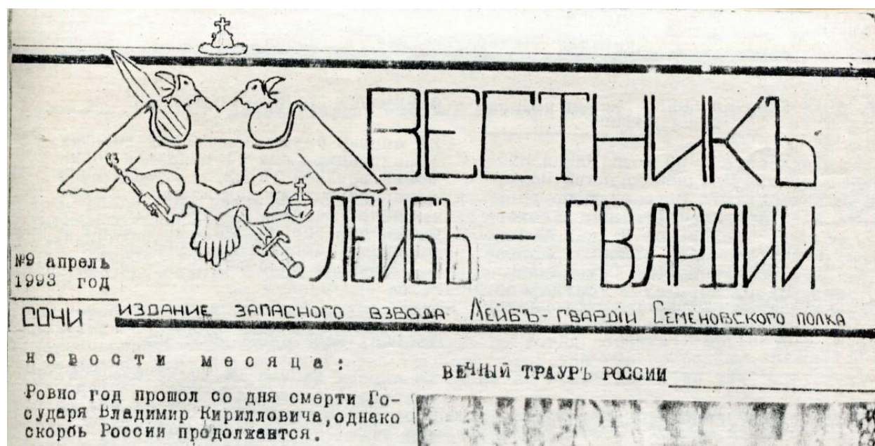
Fig. 1. The first page of the newspaper “Vestnik Leib-Gvardii” in the period 1992–1993

In the first period of the newspaper's existence, a double-headed eagle on the background of a sword was placed on the first page (Figure 1).